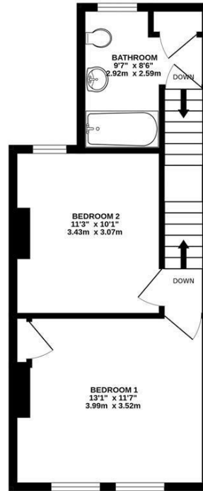
1ST FLOOR 373 sq.ft. (34.7 sq.m.) approx.